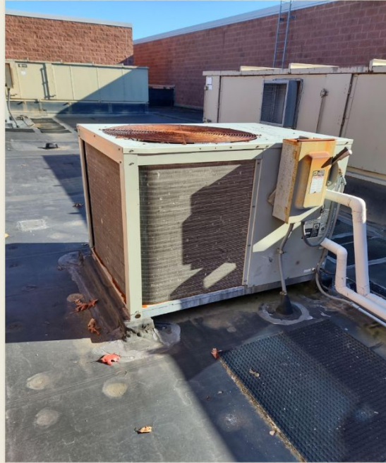
Curtis RTU-9 AC Replacement