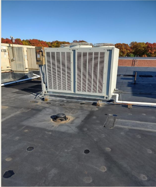
Curtis RTU-7 AC Replacement