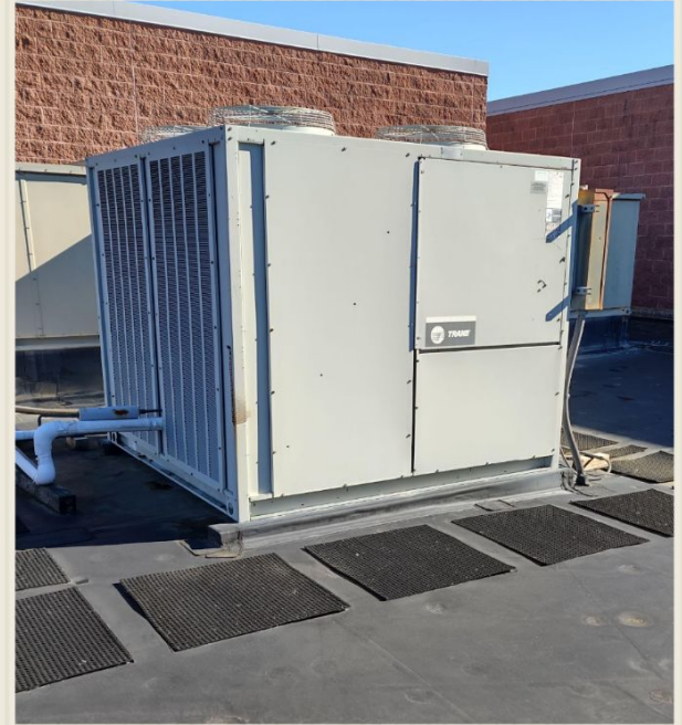
Curtis RTU-12 AC Replacement