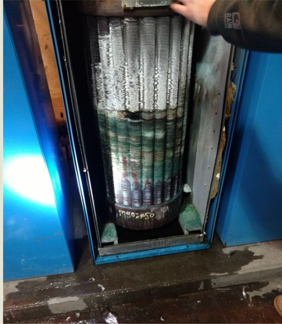
Nixon Boiler #3 Heat Exchanger