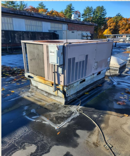
Haynes Admin RTU AC Replacement