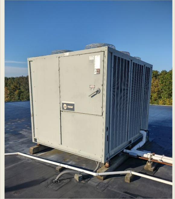
Curtis RTU-5 AC Replacement