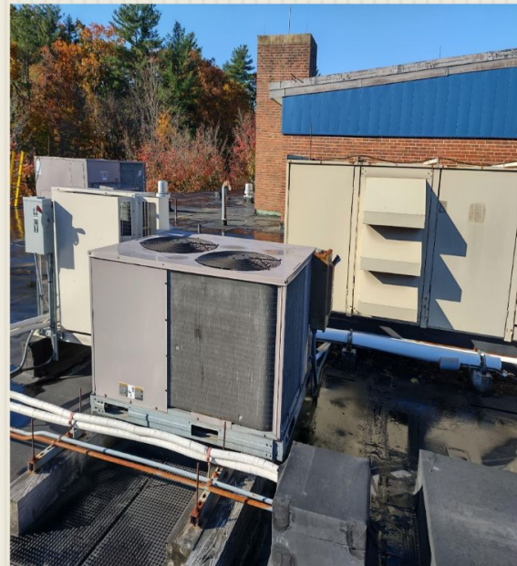
Haynes Library AC Replacement