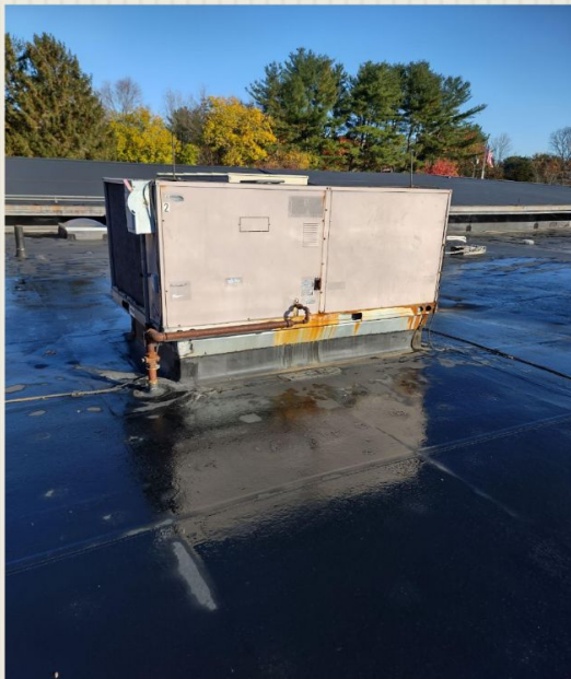
Haynes Media RTU HVAC Replacement