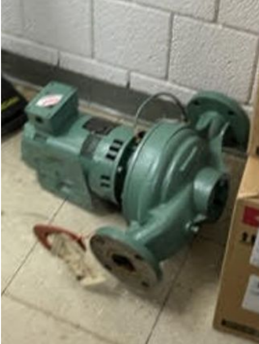
New Noyes Main Heating Unit Circulator Pump prior to installation