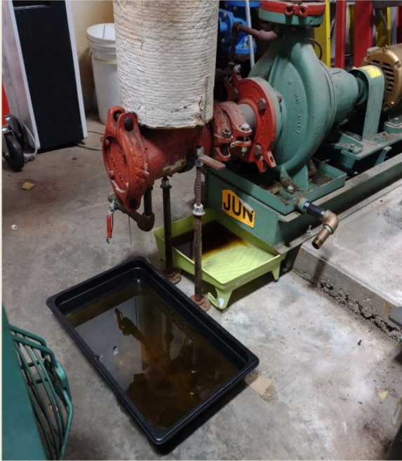
Noyes Main Heating Circulator Pump